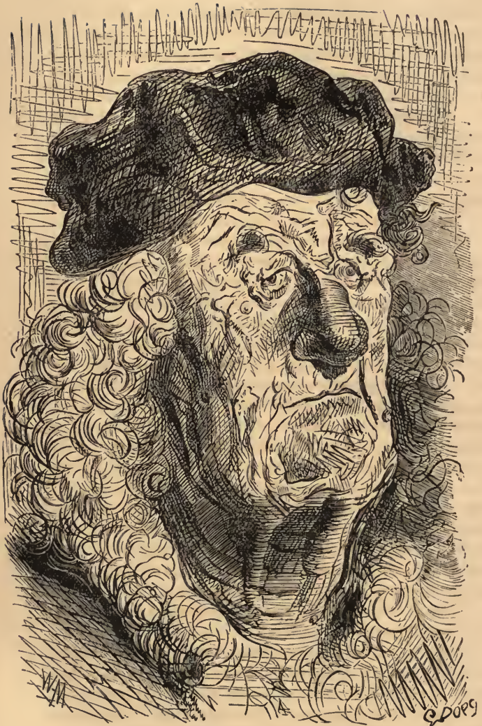
The advocate Féron.